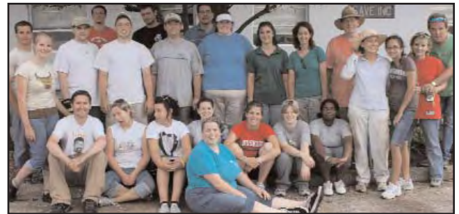
Above: Members of the Church of Jesus Christ of Latter Day Saints 2nd Branch Young Singles spent a Saturday beautifying the entrance to the Administration Building at SAVE. The final result is pictured at left.