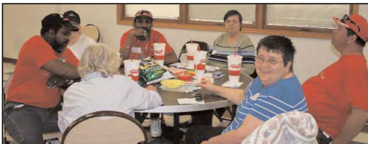
SAVE consumers volunteered their help collecting the answer sheets at Trivia Night. Between rounds they snacked and visited with friends.