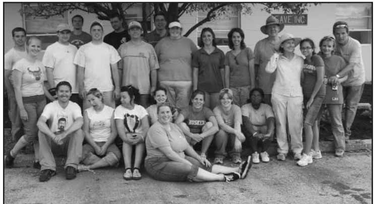
The Young Singles group at SAVE.

Because of their tremendous help, the Church of Jesus Christ of Latter Day Saints in O'Fallon, IL was named SAVE's Volunteer of the Year at the Annual Awards Reception. Thank you again!