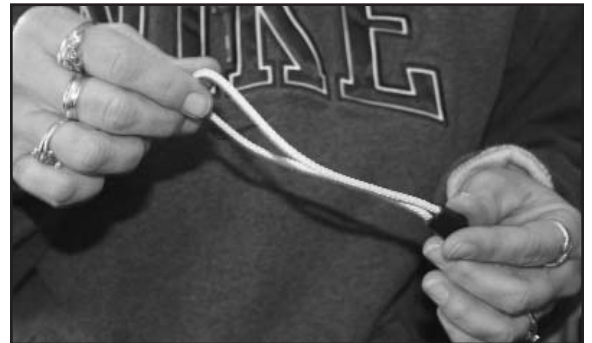
The black plastic end caps are put onto a bright yellow cord for ROHO Group by SAVE consumers.