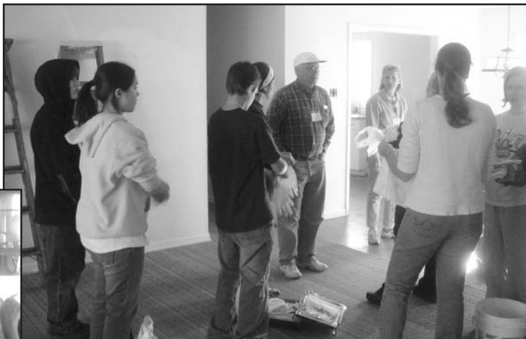
After breaking into teams, the groups received instructions from the adult leaders and went to work!

Armed with ladders, rags and paint brushes, the group cleaned and painted two houses on Turkey Hill.