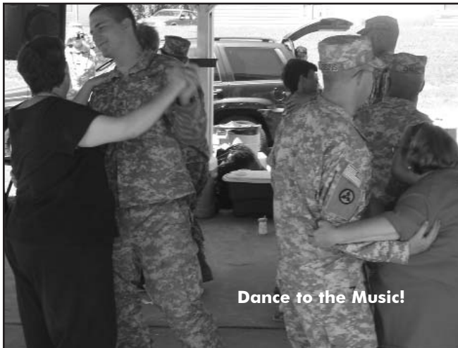
Dance to the Music!