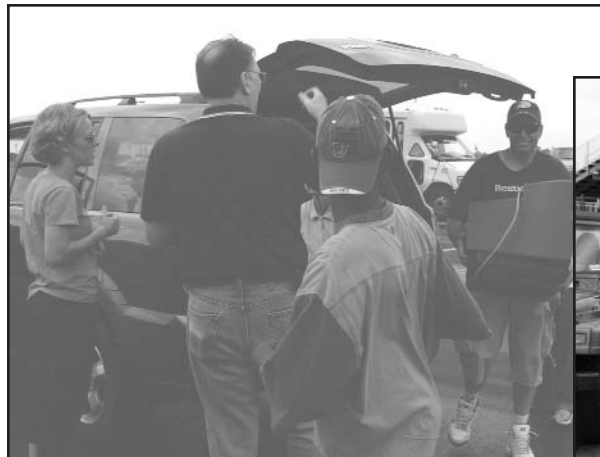
Consumers and staff receive electronics for recycling from area residents.

Almost 2000 households participated in this event, and SAVE took in over 74,000 pounds of electronic waste. SAVE and Secure Processors stacked and palletized enough TVs, computers and monitors to fill three semi trailers!