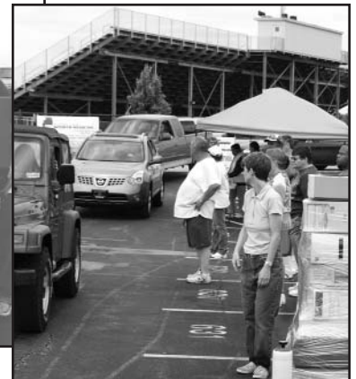
Cars lined up to unload household waste and electronics.