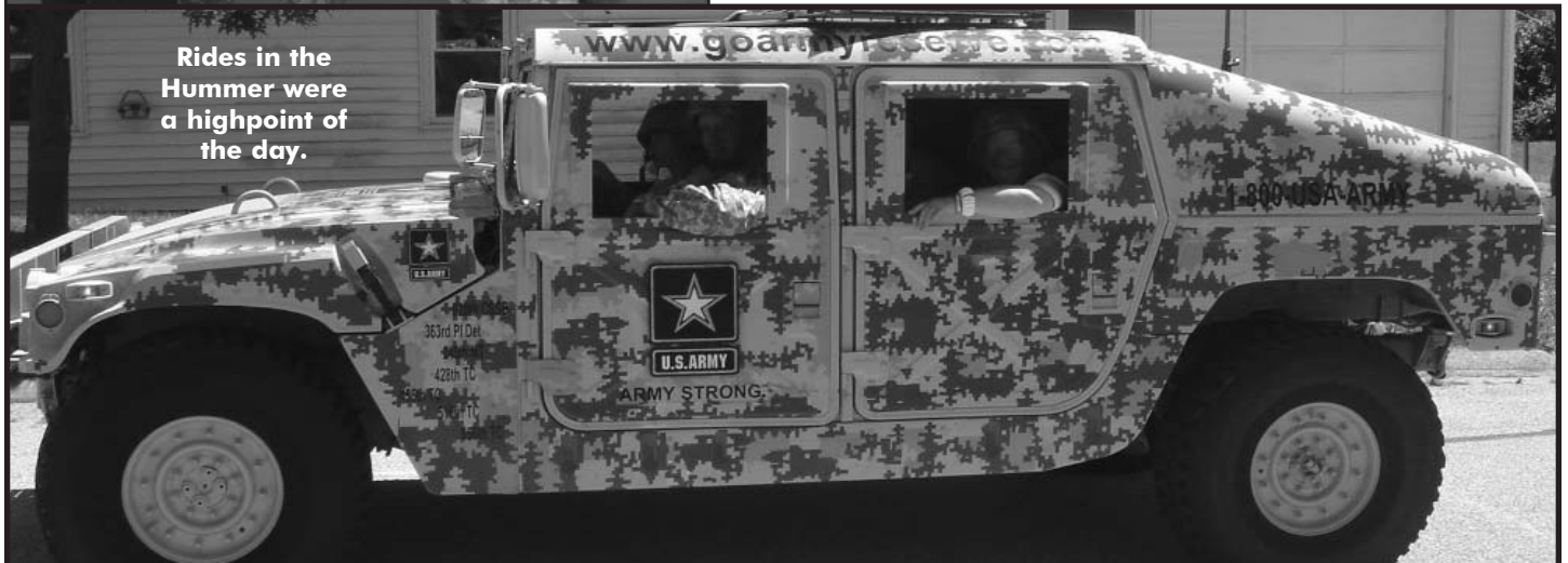
Rides in the Hummer were a highpoint of the day.