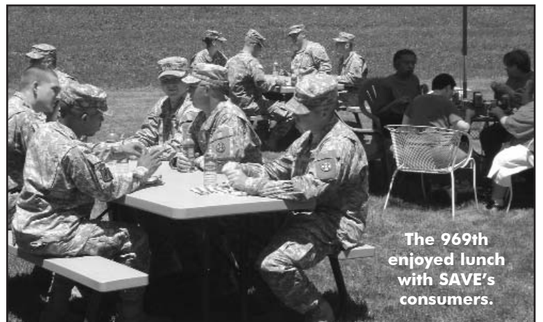
The 969th enjoyed lunch with SAVE's consumers.